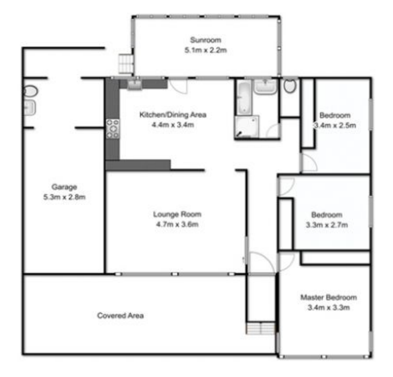
21 Amazon Road Seven Hills

Plans are for presentation purposes only and are not part of any legal document or title. They should not be used as sole reference. Interested parties should make their own enquiries using other sources. Measurements are approximates.