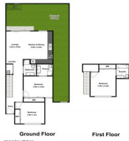
8/21 Carinya Road, Girraween