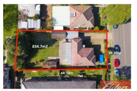
119 Dunmore Street Sold for $1,433,000