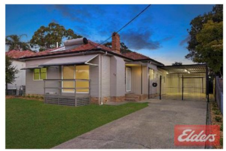
28 Bulli Road Sold for $875,000