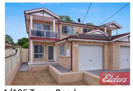
1/196 Targo Road Sold for $812,000