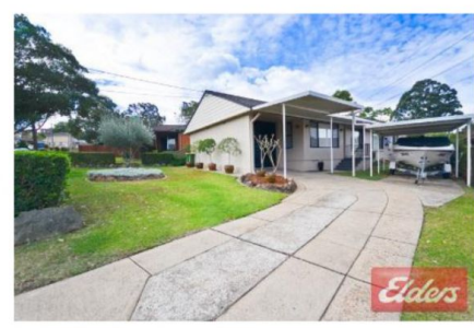
4 Caledonian Ave Sold for $957,000