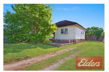
29 Cornelia Road Sold for $780,000