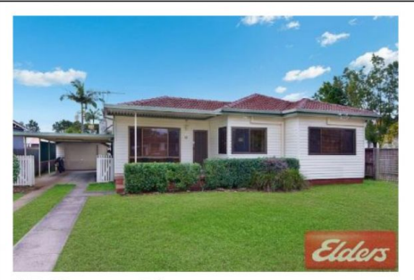
15 Kansas Place Sold for $810,000