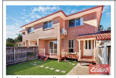
15/8-10 Metella Road Sold for $660,000