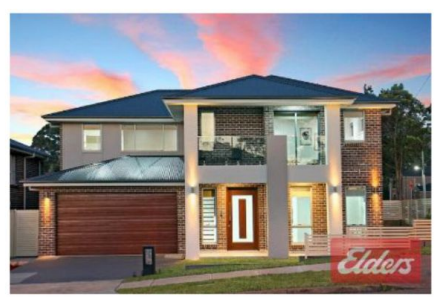
41 Burrabogee Road Sold for $1,240,000