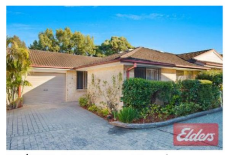
15/167-169 Targo Road Sold for $711,000