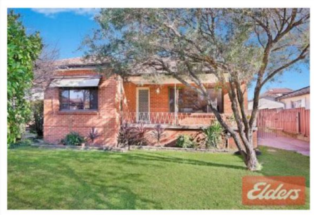
22 Bryson Street Sold for $865,000