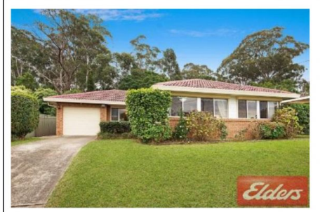
60 Thane Street Sold for $912,000