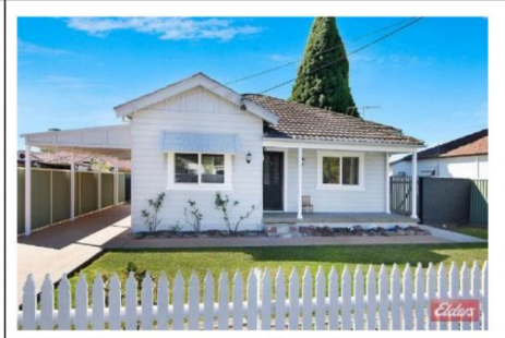
12a Barangaroo Road Sold for $795,000