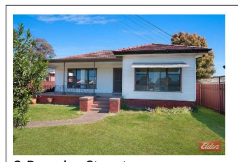
2 Premier Street Sold for $770,000