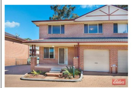
4/36 O'Brien Street Sold for $490,000