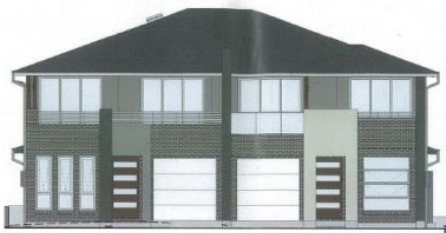
D.A. APPROVED DUPLEX